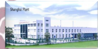
● Shanghai 上海