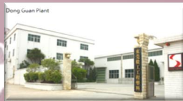
● Dongguan 东莞