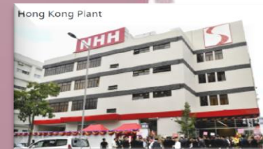
● Hong Kong Head Office 香港总部